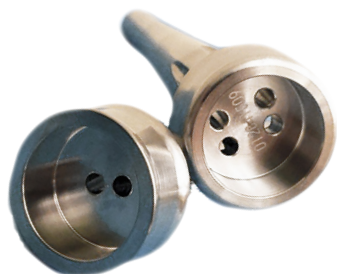
Available in 2 and 4 hole designs