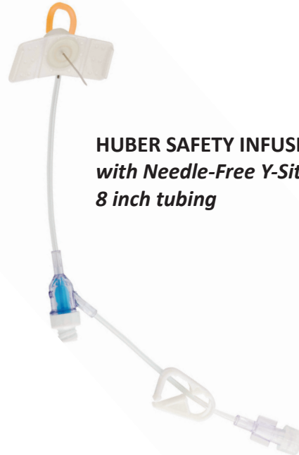
HUBER SAFETY INFUSION SET with Needle-Free Y-Site 8 inch tubing