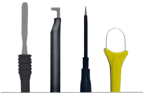
PMI Disposable Laparoscopic Electrodes

Visit us @ www.progressivemedinc.com to learn more about the products Progressive Medical, Inc. has to offer.