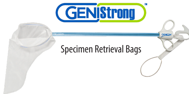
Specimen Retrieval Bags

Progressive Medical, Inc. | 997 Horan Drive | Fenton, MO 63026 | USA