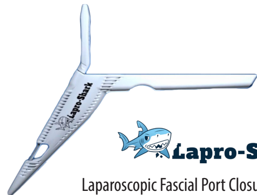
Laparoscopic Fascial Port Closure Device