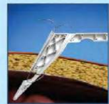
Extract Needle and Device and Tie Suture in Usual Fashion

For more information please visit www.lapros shark.com