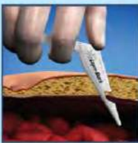
Insert Lapro-Shark™ and Capture Fascia