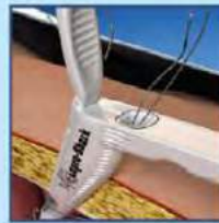
Insert Other End of Suture via Suture Guide