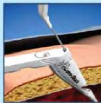
Insert Needle via Needle Guide