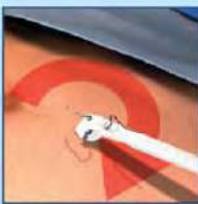
Rotate Lapro-Shark™ 180° Capture Fascia of Opposite Side