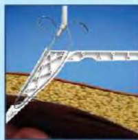
Insert Needle via Needle Guide