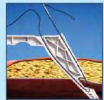
Withdraw Needle and Suture