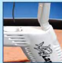
Insert Suture via Suture Guide